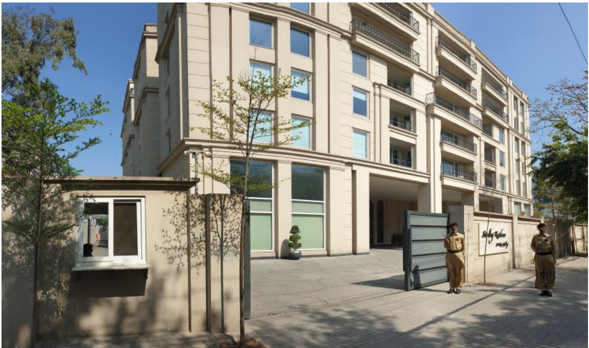
Sterling Residences Lahore. A Premium Residential Apartment Building in Lahore

Our most recent flagship residential apartment building, Sterling Residences Lahore , became operational in 2022. It is located in Main Gulberg, off Main Boulevard road; considered the most posh and central locality of the city of Lahore. Sterling Residences Lahore is considered as the “Gold Standard” amongst such developments. It is equipped with a state of the art Building Management System (BMS), and to ensure optimum building operations, our company provides comprehensive building management services.